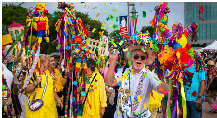
Fiesta in San Antonio.

The Texas Impaired Driving Task Force's stakeholders are actively exploring ways to address this issue, including the potential to reestablish oversight and accountability in SFST training. Ensuring that all officers receive consistent, evidence-based instruction is essential to maintaining the integrity of impaired driving enforcement and protecting the safety of Texas roadways.