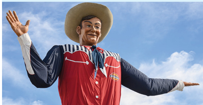
Big Tex at the State Fair of Texas.

These operations help ensure retailers follow the law and protect communities by reducing underage access to alcohol.