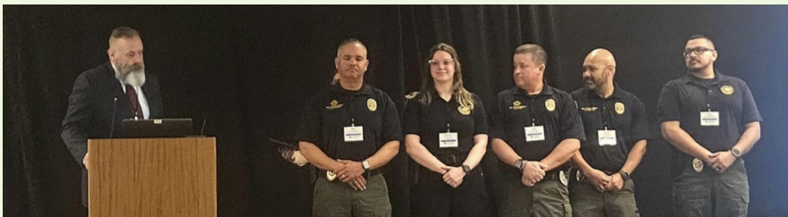
2025 Impaired Driving Safety Award Recipients: Round Rock Police Department DWI Enforcement Team.